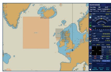
AIO (via C-Map CAES)